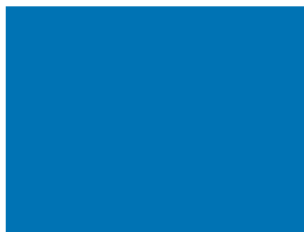
A Nepalese cook working with methane gas

Offshore technology holds great potential