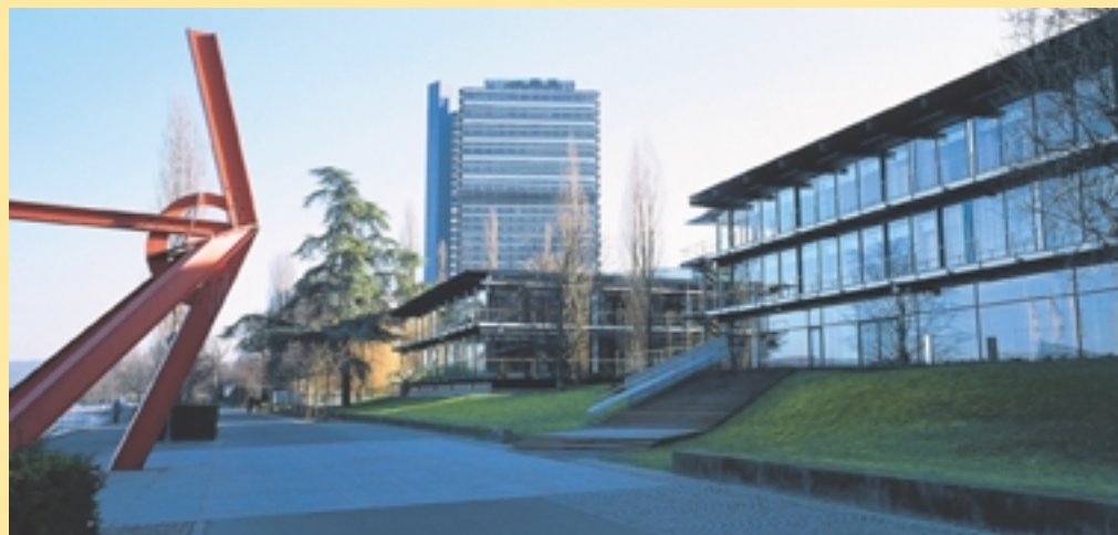
The conference venue on the banks of the Rhine river

Costs of the presentations will be borne by the exhibitors. Technical support and other inputs can be obtained from service providers, who will be designated by the Conference Secretariat. Details will be announced by the Secretariat after the selection has been completed.