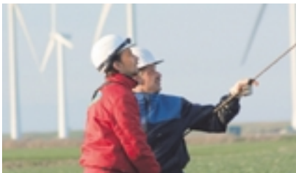
Repowering in Schleswig-Holstein, Germany