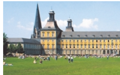
The University of Bonn

As a conference venue, Bonn has demonstrated its capabilities on the occasion of several UN member state conferences and major international meetings, such as the International Freshwater Conference in 2001. Rooms and facilities in the International Congress Centre Bundeshaus Bonn – directly adjacent to the UN Campus – as well as in the conference sites around it, and soon in a further large plenary hall with annexes, are all in accord with the high standards of quality and security demanded by the United Nations.