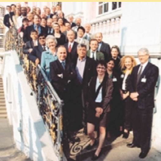
The International Steering Committee

The National Advisory Committee (NAC) is the conference forum for German actors in the field of renewable energies and development cooperation. The group includes members of the Bundestag (German parliament) and representatives of the German federal states (Länder), associations, the private sector, academic and scientific institutions, and non-governmental organisations: all have expertise and experience in the conference fields – national and/or international – that are to be integrated into the preparation process. The 45 members were appointed by the two ministries in charge of the conference.