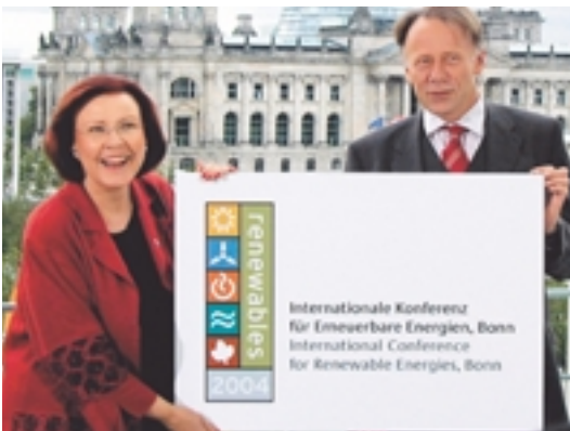
Ms Heidemarie Wieczorek-Zeul and Mr Jürgen Trittin