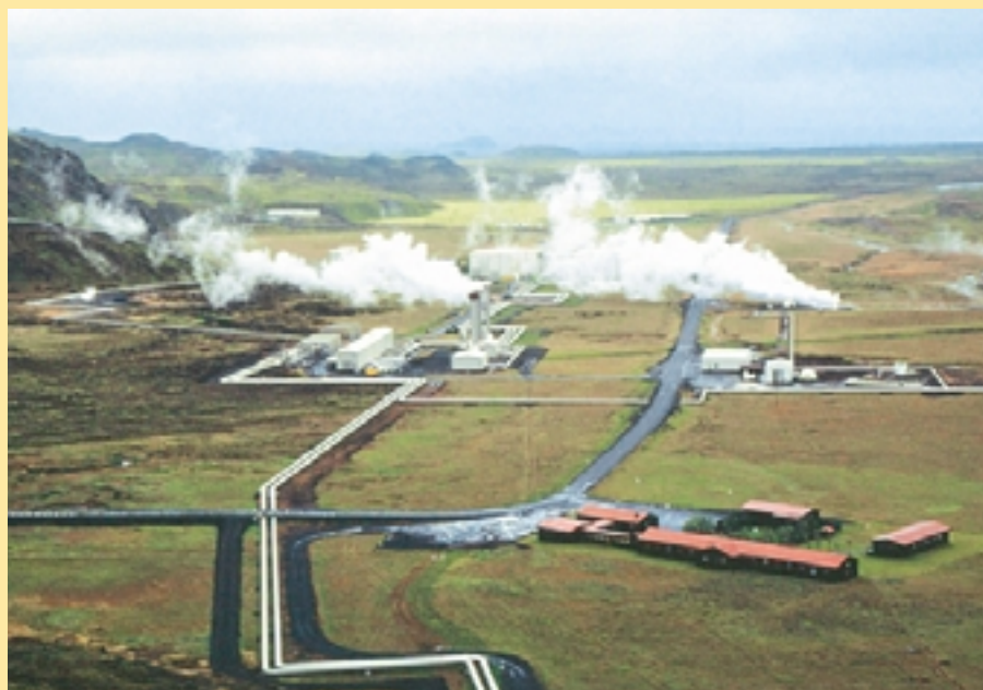
Geothermal power plant in Iceland

The government of the Federal Republic of Germany has invited, at the highest possible level, UN and other international organisations to participate in the conference. The draft conference programme, the technical information for participants and the registration forms were sent out at the end of January 2004 . Additional copies may be obtained from the Conference Secretariat and from German embassies/permanent representations. Participating organisations are kindly requested to forward a list of delegates to the conference conveners by 30 April 2004 via German embassies/permanent representations. In addition, each delegate is requested to submit a registration form to the conference registration office.