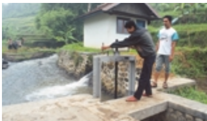
Minihydro power station for an Indonesian village that has no grid