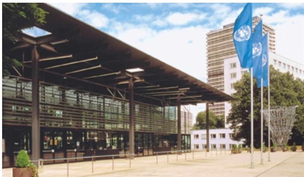
The International Congress Centre (IKBB) in Bonn

The organisers disclaim all responsibility for medical, accident and travel insurance, for compensation for death or disability, for loss of or damage to personal property and for any other costs or losses that may be incurred during travel time or the period of participation. In this context, it is strongly recommended that conference participants obtain international medical insurance for the period of participation.