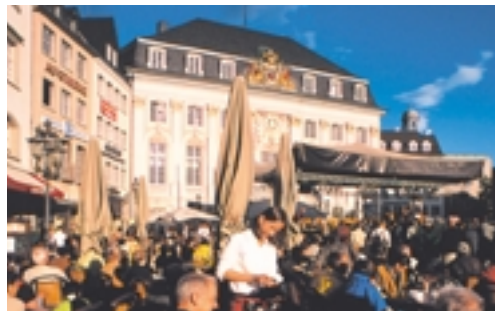
Colourful festivities in Bonn's market square