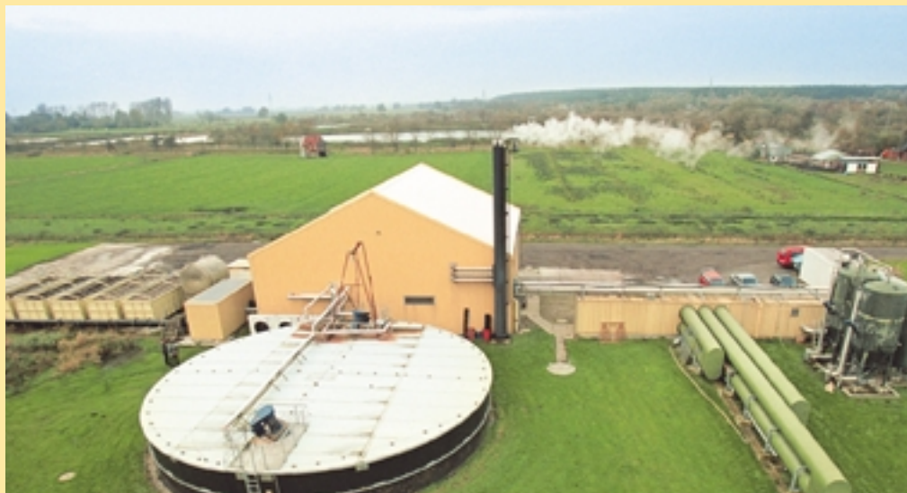
Biogas plant in Schleswig-Holstein, Germany

On arrival in Bonn, delegates eligible for financial assistance will be reimbursed for their travel expenses and given per-diem allowances at the Conference Secretariat upon presentation of the original ticket for the flight from the closest-to-home airport to Cologne/Bonn, Düsseldorf, or Frankfurt/Main.