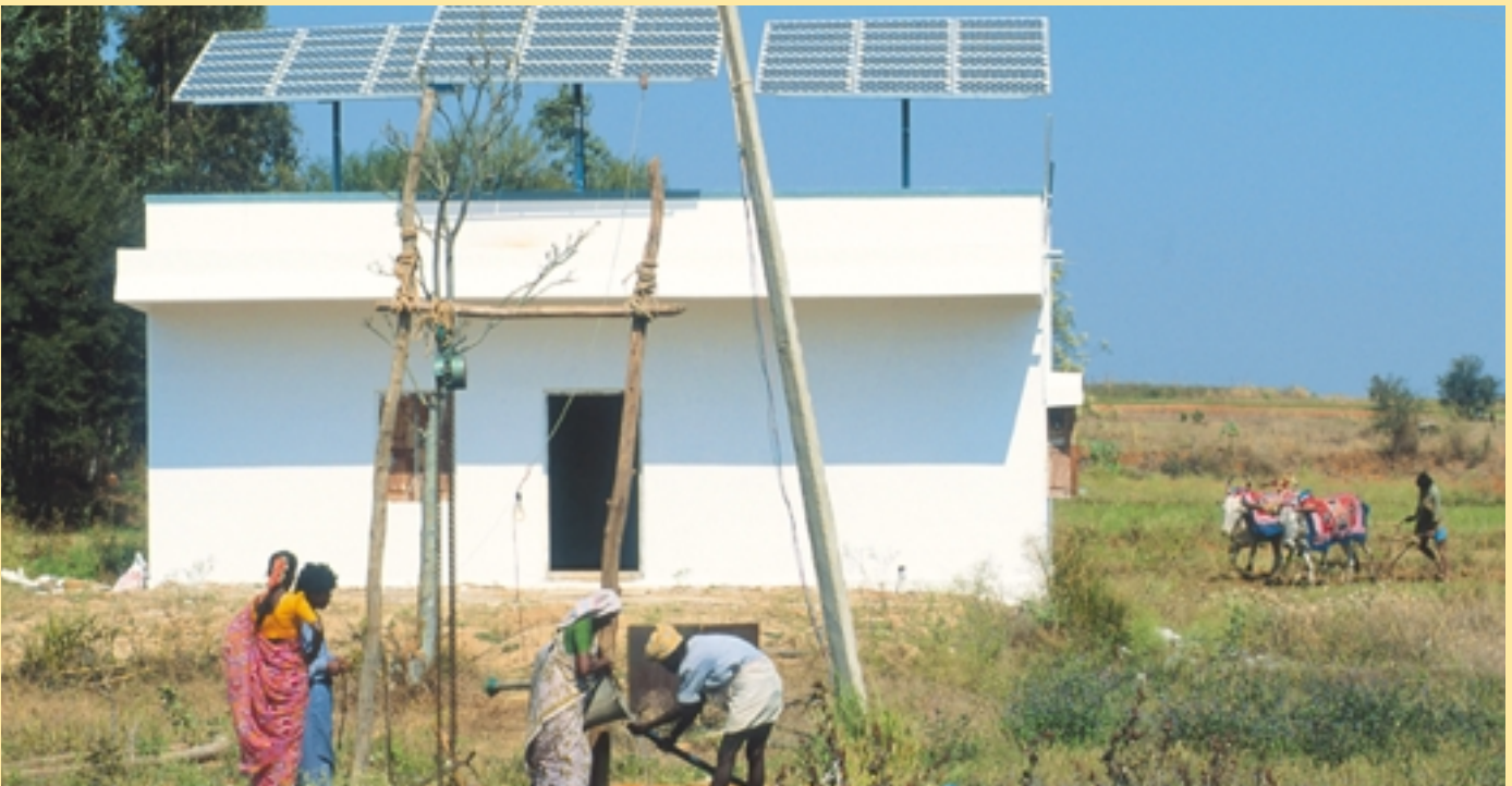
Solar panels on an Indian farmhouse roof provide power for an electric water pump

There will be two days of minister attendance (3 – 4 June). The ministerial segment will be opened by German Chancellor Gerhard Schröder and other outstanding keynote speakers. It will bring together statements from governments playing key roles in fostering renewable energies and the reports and commitments of the different segments of the conference. For instance, stakeholders will be given the opportunity to present the results of the multi-stakeholder dialogue. Ministers and other delegates will discuss the proposed conference outcomes. The ministerial working groups, broken down into thematic panels, offer an interactive discussion, focusing on solutions. They are open to ministers and other delegates.