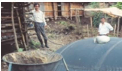
Production of biogas on an Indian tea plantation

Energy services are fundamental for human welfare and important preconditions for social and economic development. However, most economies rely on an inefficient use of energy with high shares of fossil sources. Today's global energy system is unsustainable in economic, social and ecological terms. The key question is how to make a global transition to a sustainable energy system in an active and timely manner, while allowing for the social and economic development of both industrialised and developing countries. Renewable energies can significantly contribute to this great challenge: