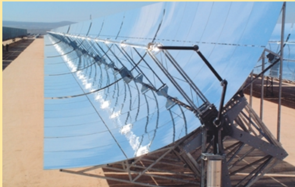
Large-scale solar thermal power plant with parabolic trough technology, Spain