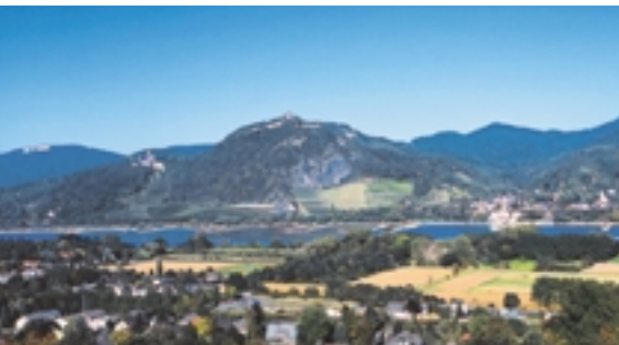
Bonn's Siebengebirge (The Seven Hills)

Once a Roman stronghold, later a medieval trading centre in the region and seat of the powerful Cologne archbishops, Bonn – now a university city rich in culture – can look back on a long history. Fifty years as the seat of government have made Bonn more than ready to meet its present-day responsibilities as a United Nations city and a focal point where UN organisations, six German federal ministries and more than 150 non-governmental organisations address tomorrow's issues today. The German government's decision to expand Bonn's UN Campus laid the foundations for the city's further development as an up-and-coming international hub for expertise in the fields of environment, development and health. Add to this the presence of major scientific institutions in this tradition-rich university city and the ease of access to leading business and research enterprises concentrated along the Rhine between the Main and Ruhr rivers. In Bonn itself, the economic focus lies in the telecommunications and service industries.