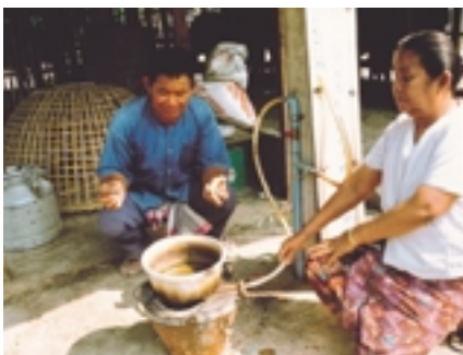
A Nepalese cook working with methane gas

Offshore technology holds great potential