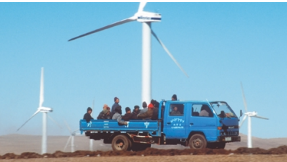
Wind energy, a natural resource in Inner Mongolia

When dealing with renewable energies, political decision-makers, administrations, technology and project developers, financiers and consumers are confronted with new and rapidly changing challenges. Individual knowledge and institutional structures are not yet sufficient to overcome the market shortcomings and barriers to financing. What is necessary to place capacity building, research and technology development and institutional improvements high on the agenda?